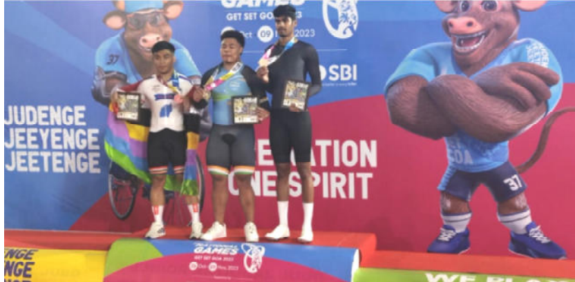
Pic shows David Beckham (Middle) with the Gold Medal in 500 Mtrs Time Trial Event (Men)